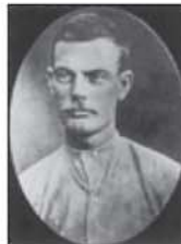
Robert, Cole and Jim Younger